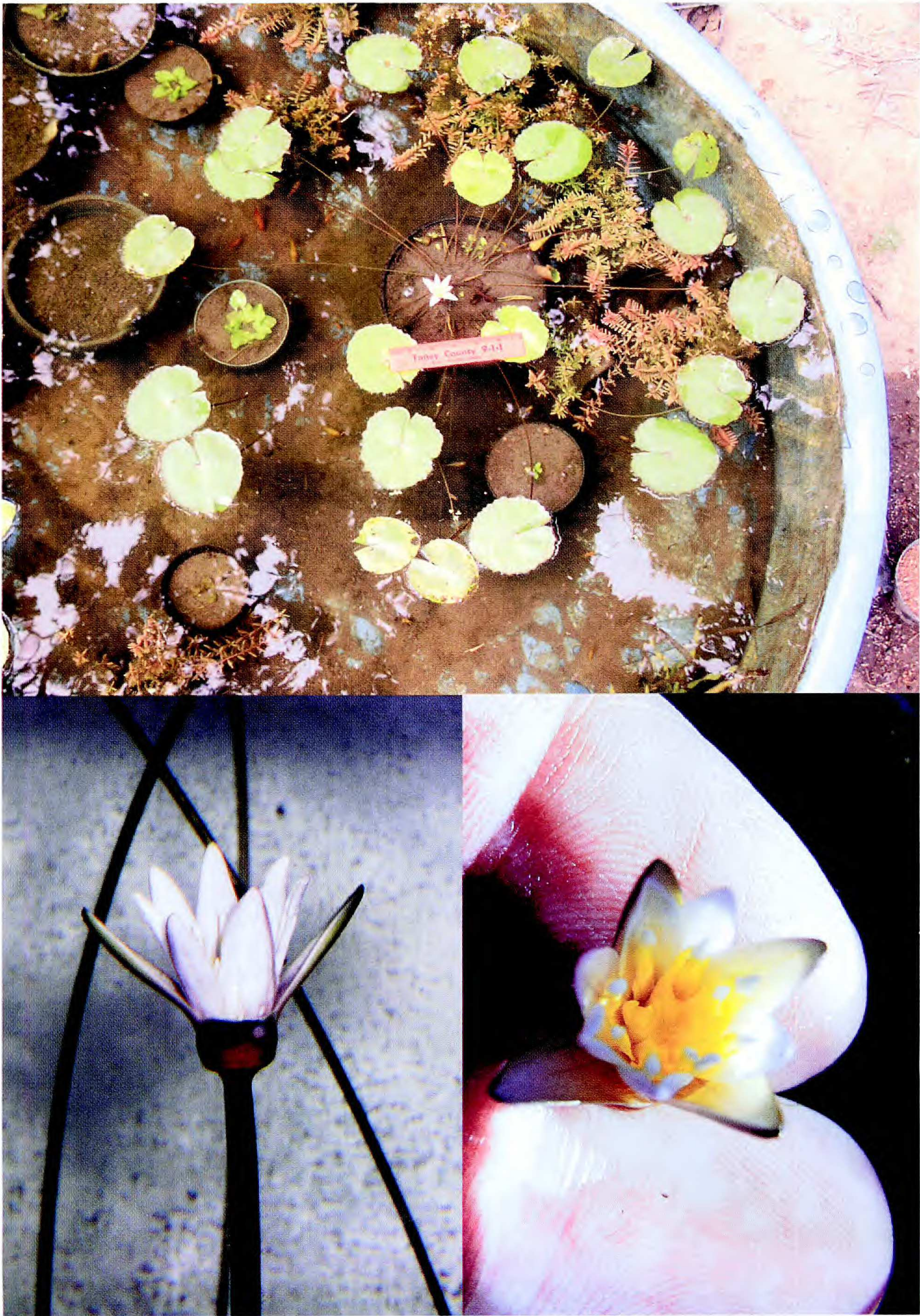
FIG. 4. Clockwise from top, mature Nymphaea minuta , emerged form with flower, ca. 60 cm wide; close up of flower showing stigmatic disk, carpellary styles and appendages on stamen; submerged flower fully open.